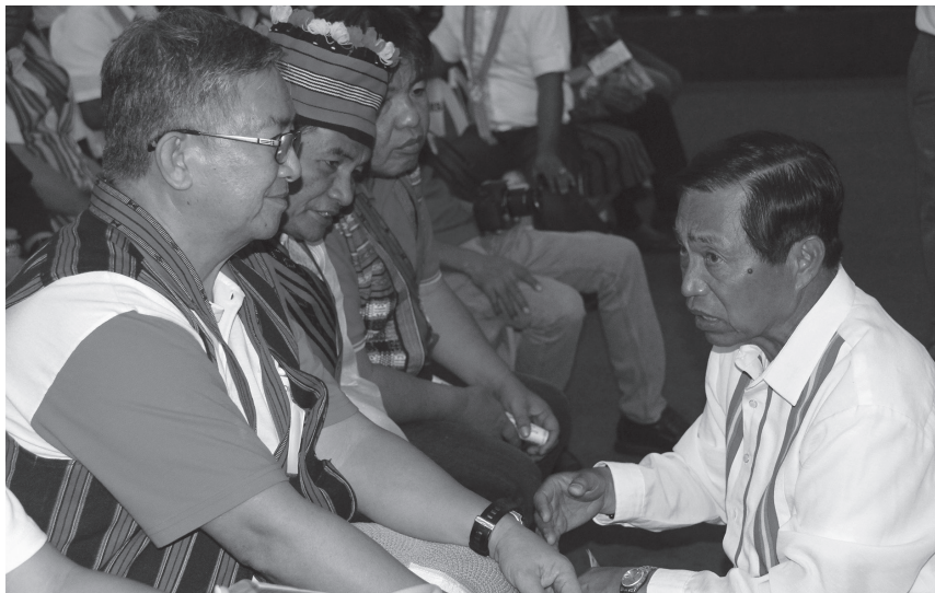
AUTONOMY OR FEDERALISM? - Mayor Mauricio Domogan, Benguet Governor Crescencio Pacalso and Ifugao Governor Pedro Mayam-o consult each other on the proposed regional autonomy or the federal system being pursued by President Rodrigo Duterte during the 29th Cordillera Month celebration last July 15.