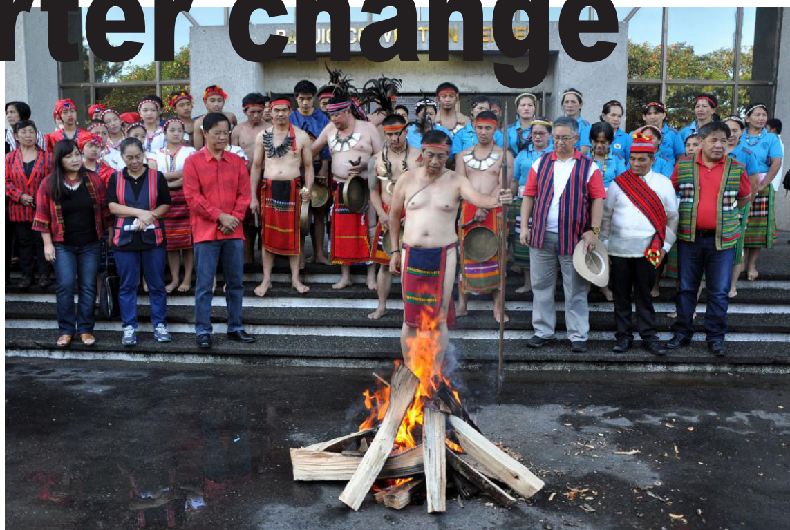
Baguio City Mayor Mauricio Domogan performs traditional rituals during the culmination of the 29th Cordillera Month celebration at the Baguio Convention Center on July 15. This year's celebration with the theme “CAR @ 29: Working together for an autonomous and empowered Cordillera,” is hosted by the Regional Development Council-Social Development Committee chaired by the Department of Social Welfare and Development and the city of Baguio as the host local government unit.

Illegal constructions in city barangays to be monitored •page 3