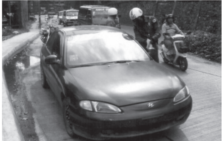
Photo shows personnel of TMG-Cordillera implementing the no plate, no travel policy.