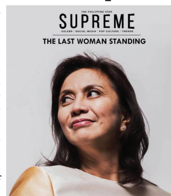
The Philippine Star Supreme cover

There are just a few more votes left to count yet before she can start. /CNA/hs/ http://www.channelnewsasia.com/