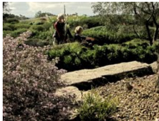
Castlemaine Stone in planting area Sally and Jill in centre stage