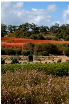
Lunettes and Red Sand Garden