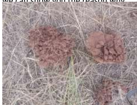
Left 4" monthly plot, Right 1" bi-weekly plot

So if you need additional incentive to not graze your pastures lower than 3 – 4" stubble height, we can show you the reason why.