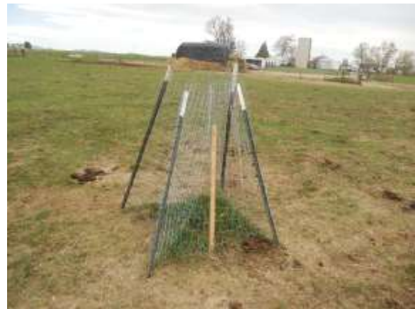
What was once a 4’X4’ exclusion plot, 2014