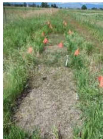
From front to back 1" bi-weekly, 2" bi-weekly, 4" bi-weekly, 1" monthly, 2" monthly, 4" monthly