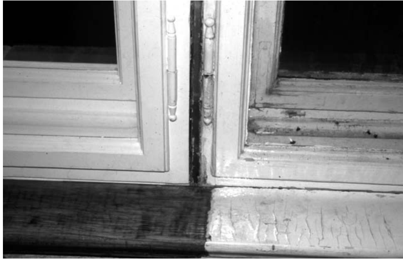
Figure 5 Window from 'Kastenfenster' in Leipzig dating from 1880.

completely removed. The outer and inner frames were fitted together and minor damage caused during transportation was repaired. After impregnation with raw linseed oil, the windows were re-glazed using linseed-oil putty of our own manufacture. Our goal was to keep the milled glass in the outer casements. As an experiment, we used 3 mm Pilkington Kappa Energy glass (K-Glass) in one of three inner casements, in order to show the differences in colour and light. Nobody noticed the difference.