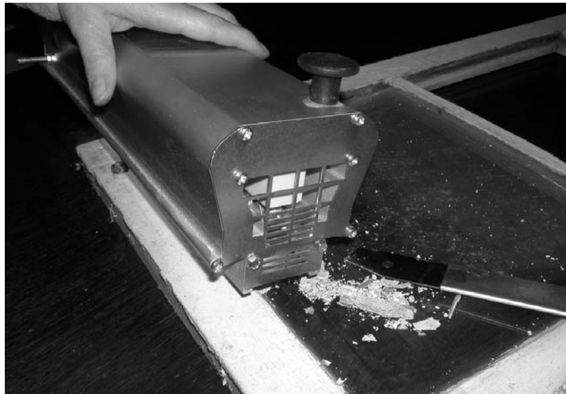
Figure 2 The putty lamp – an innovation by Sonja and Hans Allbäck.

We also found many useful hand tools and quality materials, including a hand-driven profile planer from the early eighteenth century. Even today we use this ‘machine’ to complement the work of modern machinery in renewing windows from that period (Figure 3).