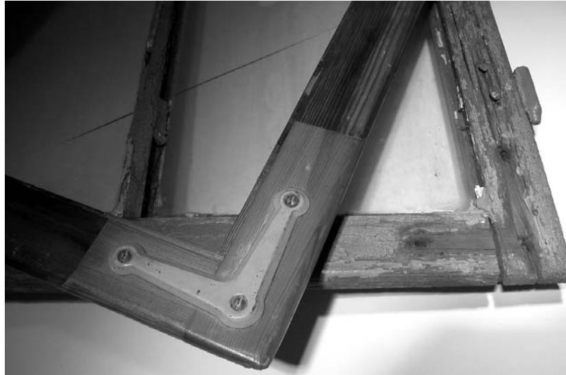
Figure 1 Windows from 1880, showing small-scale repairs.

Economics forced us to invent the simple weatherproof temporary window that made it possible to work all year around. We also made a small adjustable platform to reach windows at any height.