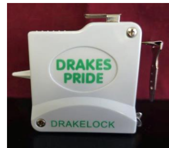
Tape measures (various) $35.00 to $50.00