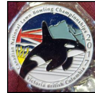
Pins (Club, Bowls BC and 2017 National Championships) $5.00