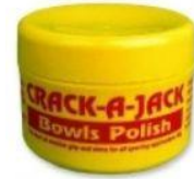
Crack-a-Jack (bowls polish and grip) $10.00