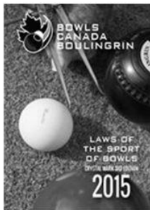
Laws of the Sport of Bowls, Crystal Mark, 3rd Edition, 2015 $5.00