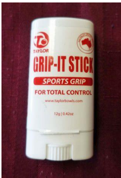
Grip-it-stick (organic grip) $18.00