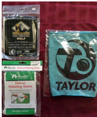
Bowl buffing cloths (various) $10 to $20