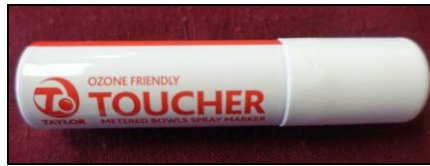
Toucher spray chalk $10.00