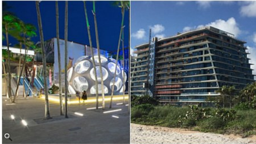
Design District/Surfside's Fendi Chateau