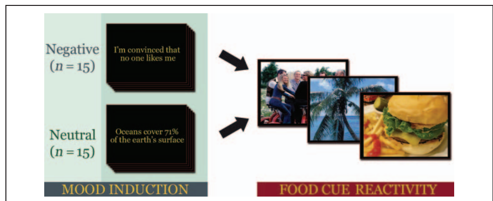
Figure 1. Schematic of the study design. Restrained eaters were randomly assigned to receive either a negative or neutral mood induction (see Methods). After this, participants performed a food cue reactivity task while undergoing fMRI. The task involved making indoor or outdoor judgments on images containing high caloric appetizing foods or natural scenes.

MRI was conducted with a Philips Achieva 3.0-T scanner using an eight-channel phased array coil. Structural images were acquired using a T1-weighted magnetization-prepared rapid gradient echo protocol (160 sagittal slices; repetition time = 9.9 msec, echo time = 4.6 msec, flip angle = 8^\circ , 1 \times 1 \times 1 mm voxels). Functional images were acquired using a T2*-weighted echo-planar sequence (repetition time = 2500 msec, echo time = 35 msec, flip angle = 90^\circ , field of view = 24 cm). For each participant, a single functional run of 520 whole-brain volumes (36 axial slices per whole-brain volume, 3.5-mm