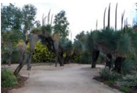
Grasstrees ( Xanthorrhoea )