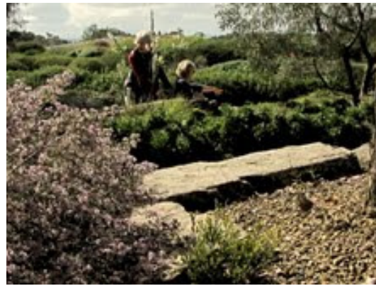
Castlemaine Stone in planting area Sally and Jill in centre stage