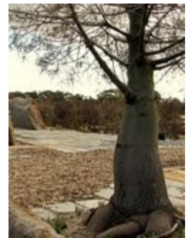
Castlemaine stone area with the bottle trees (Brachychitons).