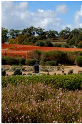
Lunettes and Red Sand Garden