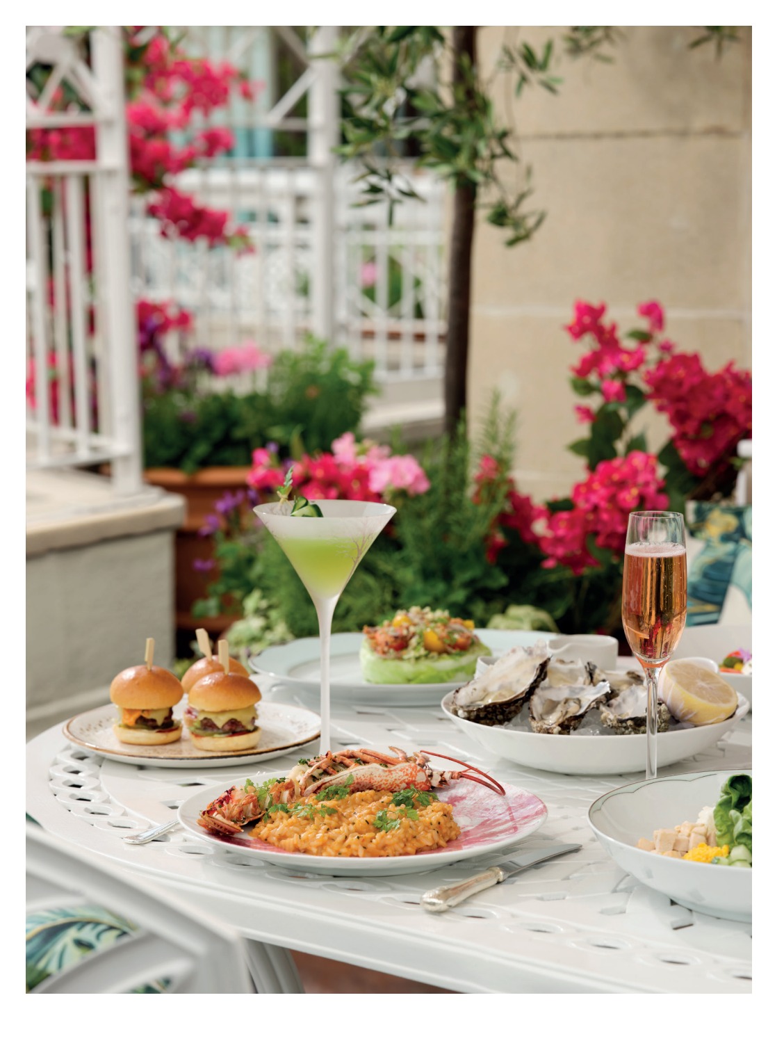
__ The Dorchester Hotel, London