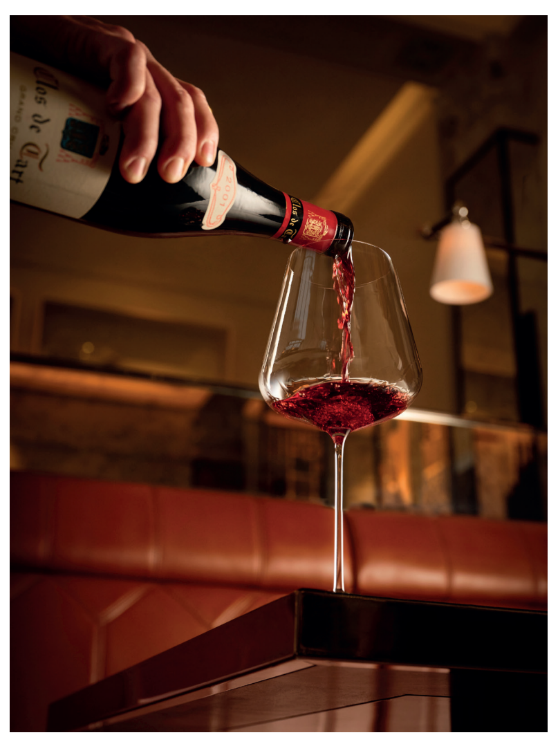
__ Latour at La Dame de Pic