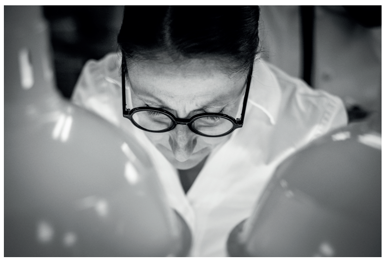
__ La Dame de Pic by Anne-Sophie Pic, London