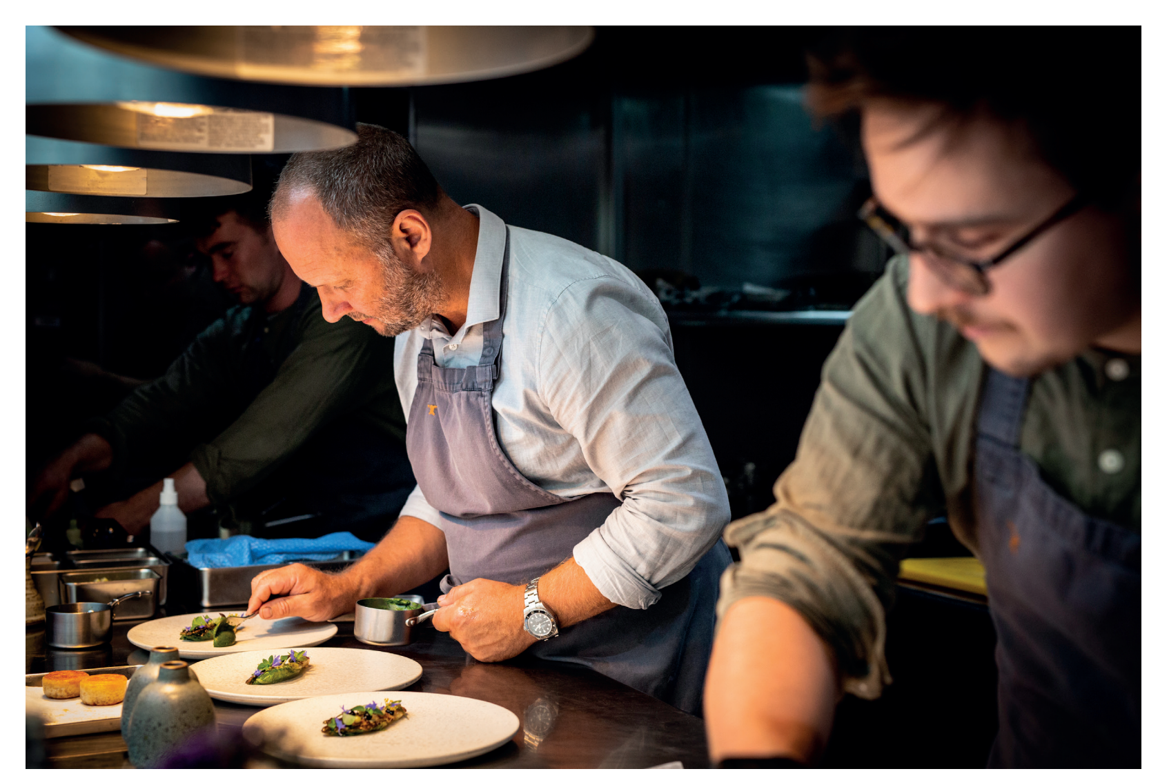
__ L'Enclume, Cumbria