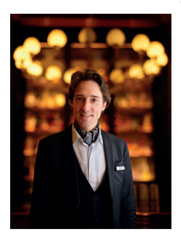
__ Four Season's Trinity Square

MARKETING TEAM FOUR SEASON'S HOTEL LONDON AT TEN TRINITY SQUARE