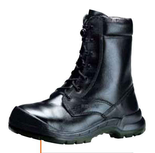
KWD912 - Black grain leather laced boot - Dual density PU outsole - PU foam insole

KWD806 - Black grain leather zip-up boot - Dual density PU outsole - PU foam insole